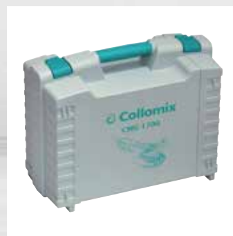
Robust case for safe and practical storage