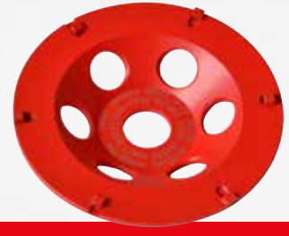
PST 125 Strap-it