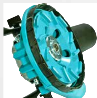
Closed lamellar ring for low-dust working*