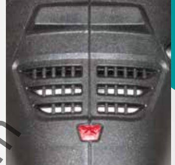
Visual performance monitoring as overload protection