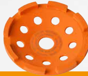
GST 125 Grinder