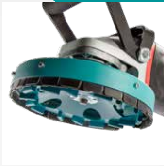
Closed lamellar ring for low-dust working*