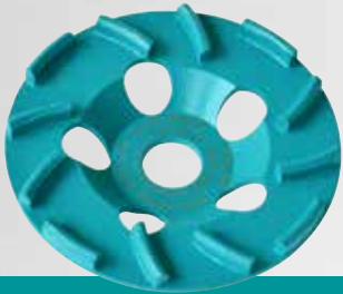
BST 125 Cyclon

for the concrete grinder CMG 1700 (∅ 125 mm)