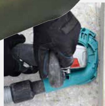
Practical segment opening for precise working on edges