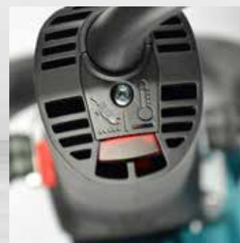
Visual performance monitoring as overload protection