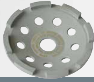
UST 125 Universal