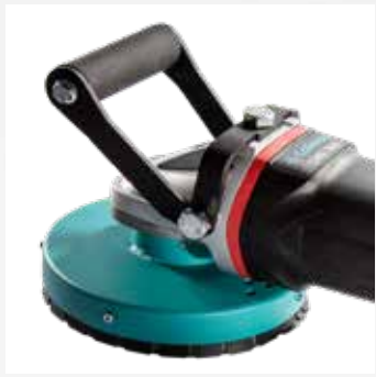
Comfortable grip for an optimum hold and safe grinding